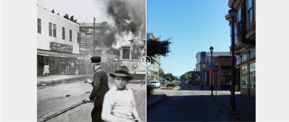
Left image Credit: "Images of America: Eureka and Humboldt County" Clarke Historical Museum 2001 Arcadia Publishing