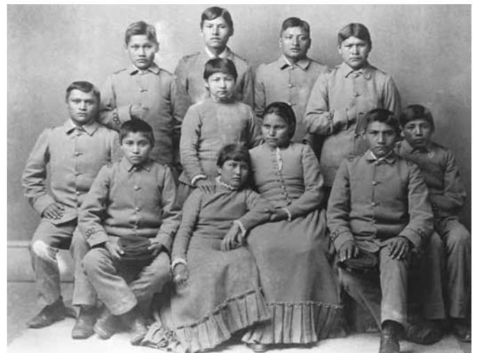
(Left) Chiracahua Apaches as they looked upon their arrival at the Carlisle Indian School, an institution dedicated to inducing Native Americans to abandon their traditional ways. (Right) Chiracahua Apaches after four months at the Carlisle Indian School.