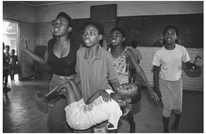
April 1994, Soweto, South Africa — Members of a Soweto school drama group reenact the events of the 1976 Soweto student uprising.

Today assimilation is still happening. Children go to school and see that everyone else is speaking English and feel different if they are the only one who does not speak English at home. My family came here from Iran and speaks both English and Farsi. My mother and father taught me to speak Farsi, and I do at home and when I’m with my family. My younger brothers, on the